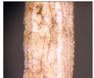
Figure 2. Ectotrophic runner hyphae of Gaeumannomyces graminis var. graminis on a zoysiagrass root